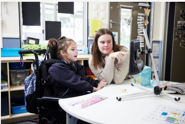
The edAnalytics Hub aims to improve educational and development outcomes for young South Australians.