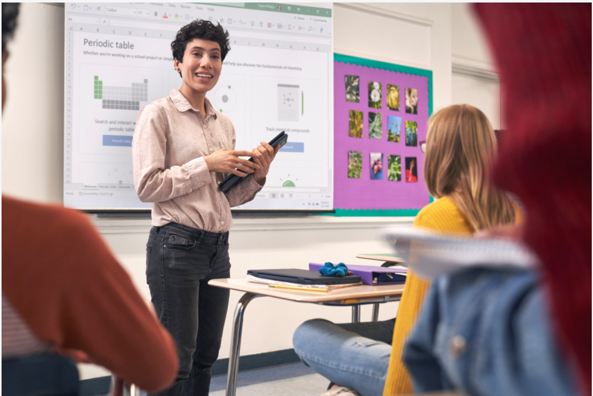
This project allows the opportunity to bring potential future data workers to the organisation, including empowering those to develop new skills in data.